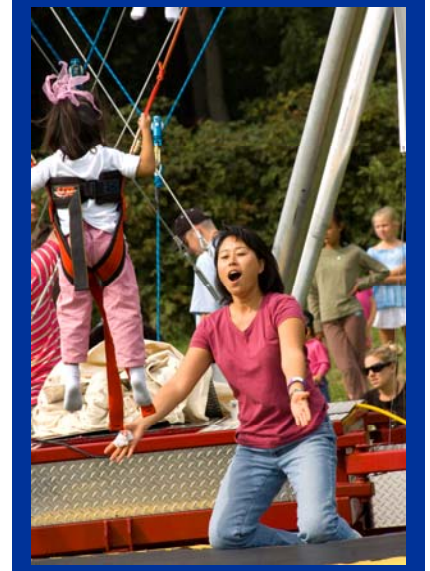
FAMILY FUN Mom and daughter share in the fun at a recent event.

Fun and safety merge in a carefully crafted amusement where each participant is secured into a 3-point harness in their own jumping station. Multiple bungee cords are attached to the harness which gives jumpers a "super boost" into the air allowing them to perform aerial maneuvers without the risks of bungee jumping. The design gives each participant their own jumping space which eliminates injuries caused by collisions with others and enhances safety.